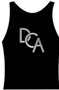
RACER BACK RHINESTONE SINGLET $65