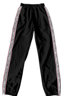
TRACKSUIT PANTS $65

The adult jackets are oversized so order your normal size. If you want a tighter fit, order 1 size down.