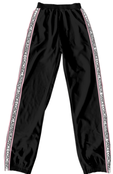
TRACKSUIT PANTS $65

This optional uniform range may be worn for all classes except ballet. Ballet dancers may wear these items to and from class.