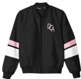
TRACKSUIT JACKET $95