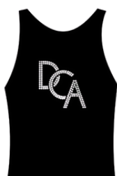
RACER BACK RHINESTONE SINGLET $65