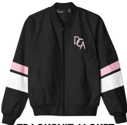
TRACKSUIT JACKET $95